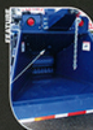
Patented Automated Feed Sensor