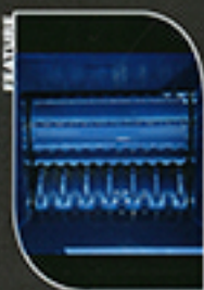
15" Hydraulic Feed Roller