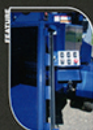
Two Control Panels with Emergency Stop