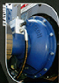
HPTO Wet Clutch