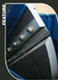
2" Thick Chipping Disc