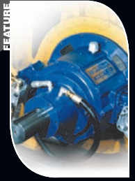
HPTO wet clutch