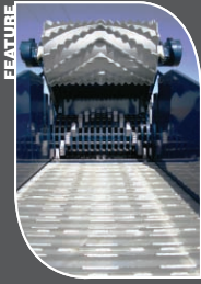
Self governing apron & feed roller