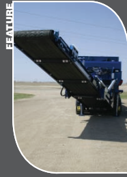
Oscillating stacking conveyor pivots 40°