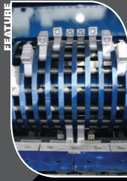
Hammermill w/32 hammers