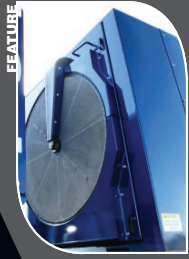
Self-cleaning air intake system