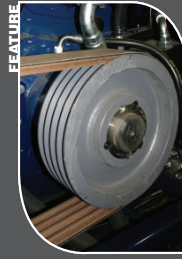
4 groove belt drive system